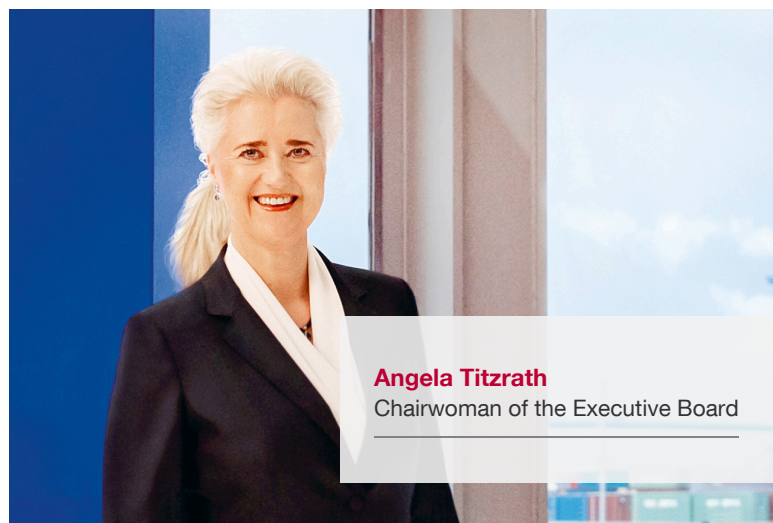
Angela Titzrath Chairwoman of the Executive Board

In such unstable environments, it is particularly important not to lose sight of our aims but to adjust our strategy where necessary to the new circumstances. HHLA will therefore continue to work on the consistent implementation of its strategic goals in order to strengthen the company's creative power and future viability. This involves, for example, continuously modernising our facilities. The dismantling of three container gantry cranes at the Container Terminal Burchardkai started in July. New gantry cranes will be built in their place, allowing mega-ships to be processed at an additional berth. We are still firmly committed